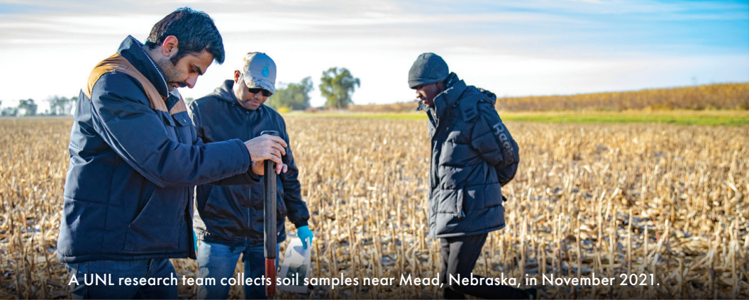
A UNL research team collects soil samples near Mead, Nebraska, in November 2021.