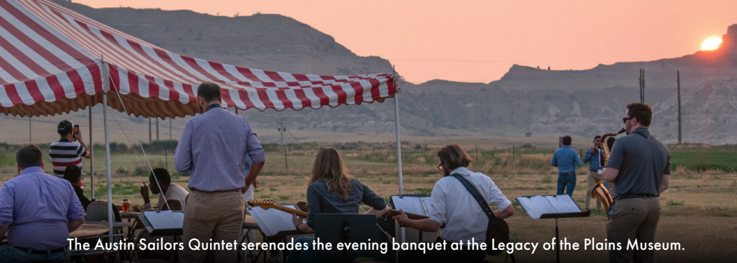
The Austin Sailors Quintet serenades the evening banquet at the Legacy of the Plains Museum.