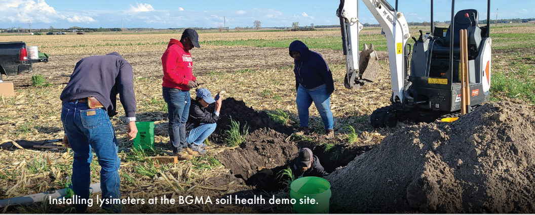
Installing lysimeters at the BGMA soil health demo site.