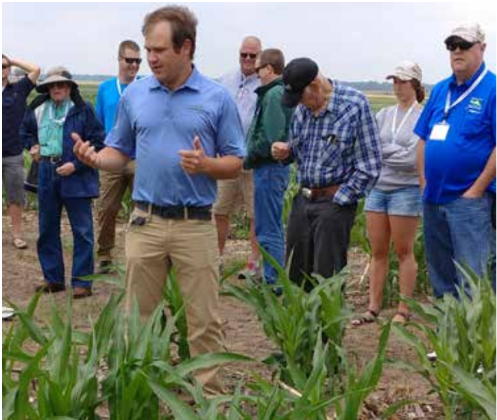
A tour of test plots at Monsanto's Gothenburg Learning Center, one of four such center's the company operates.