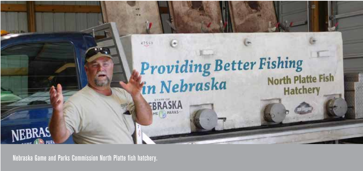
Nebraska Game and Parks Commission North Platte fish hatchery.