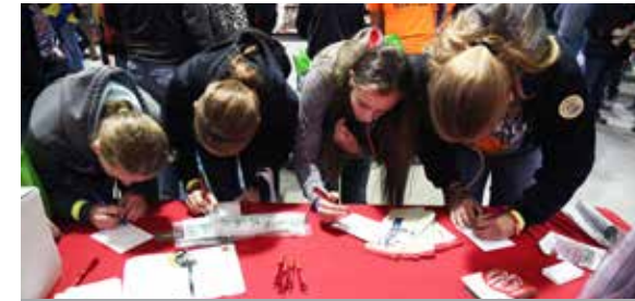
Nebraska FFA students sight-up for information on the University of Nebraska-Lincoln's College of Agricultural Sciences and Natural Resources at Husker Harvest Days.