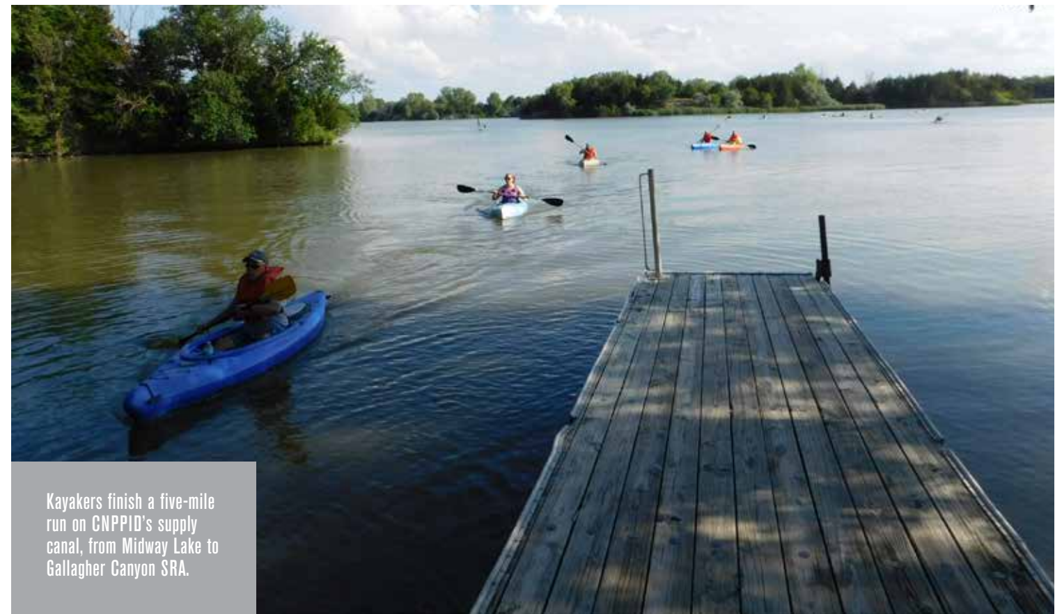
Kayakers finish a five-mile run on CNPPID's supply canal, from Midway Lake to Gallagher Canyon SRA.