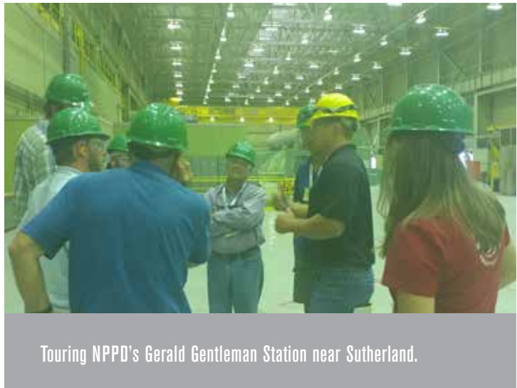
Touring NPPD's Gerald Gentleman Station near Sutherland.