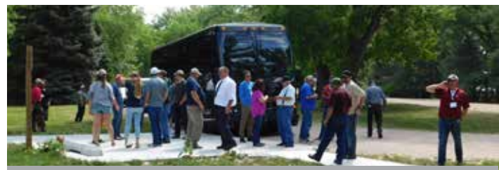
A stop in the shade at Johnson Lake near Lexington.