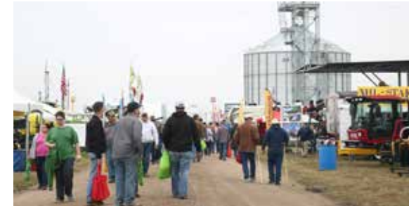
Husker Harvest Days is September 12-14 near Grand Island. The irrigated farm show is celebrating its 40th year.