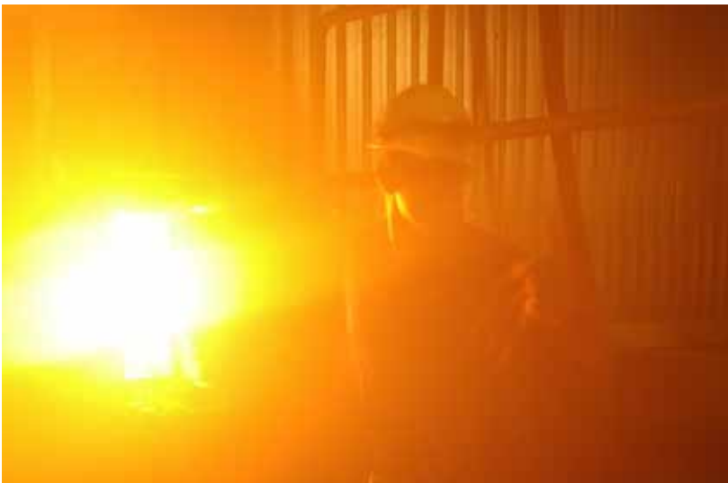
A glimpse inside the firebox of one of the boilers at NPPD's Gerald Gentleman Station power plant.