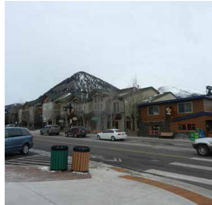
Scenic Frisco, Colorado is near the ski slopes of Breckenridge and Keystone.