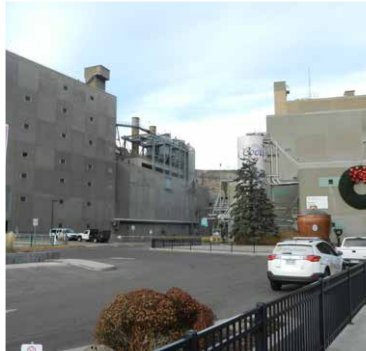
Water operations and water banking at the MillerCoors brewery in Golden, Colorado will likely be part of the tour.