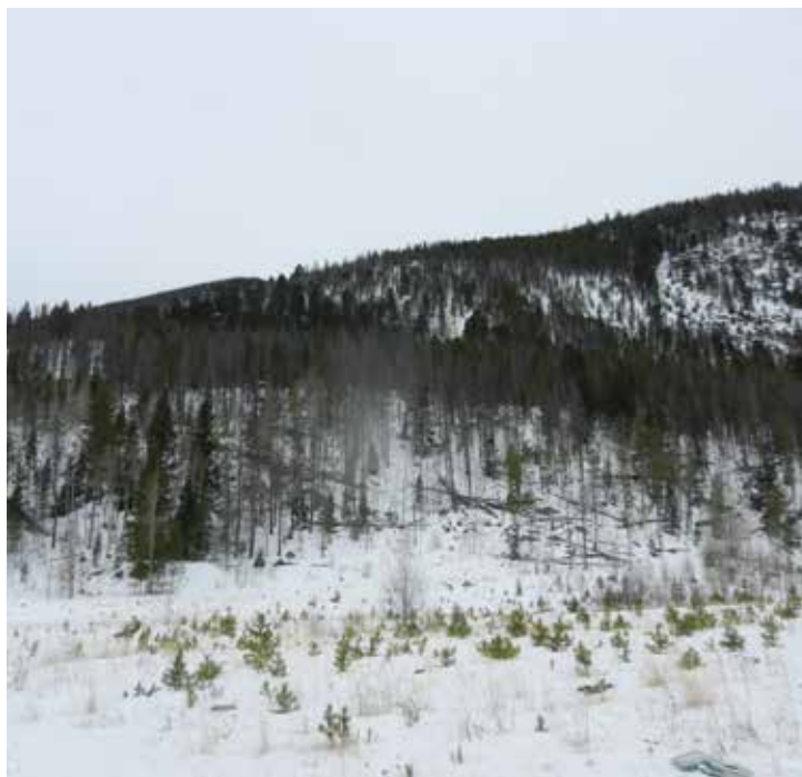
In many parts of Colorado, the Pine Wilt Beetle has reduced forests by up to 80 percent, creating areas of deadfall and altering runoff water flows in the process.