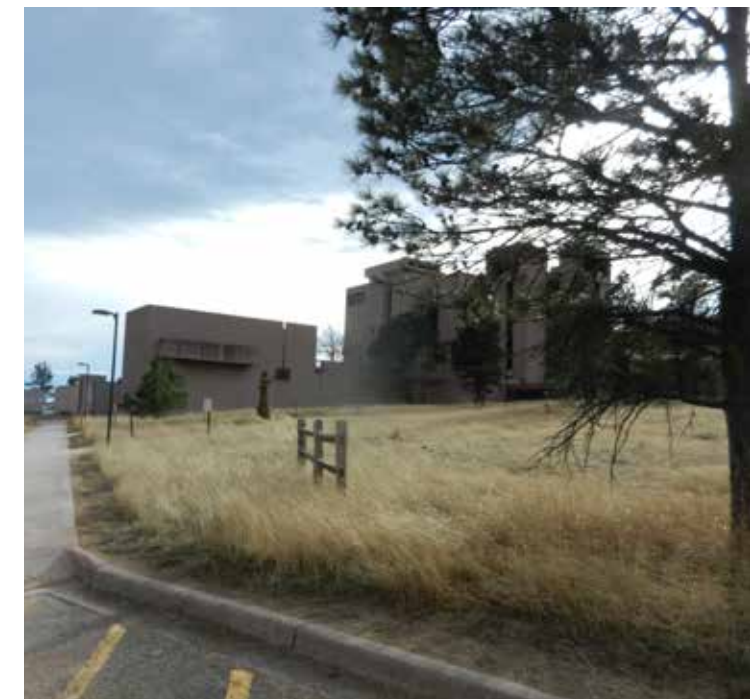
Internationally famous architect I.M. Pei designed the National Center for Atmospheric Research (NCAR) Mesa Laboratory near Boulder, Colorado. The cutting edge research center opened 50 years ago.