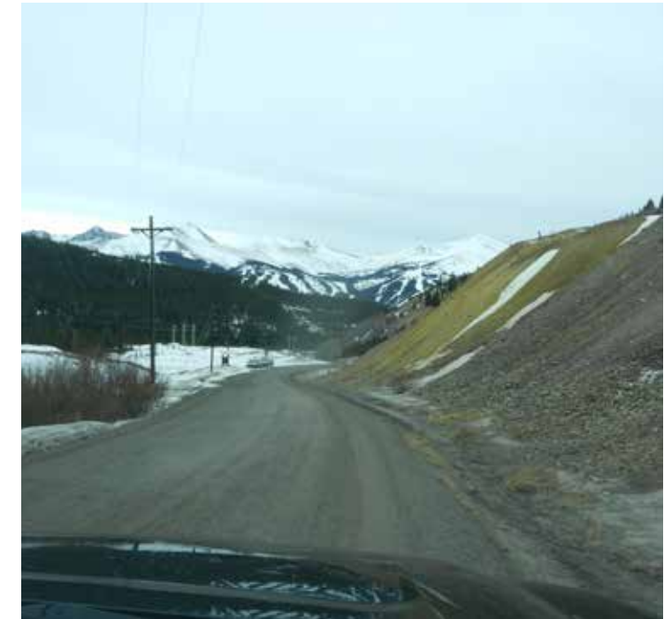
Mine "tailings," or debris (right) from commercial gold mining more than a hundred years ago are still very much in evidence in the Colorado mountains west of Denver. The industry spawned many of the communities now known for skiing and tourism.