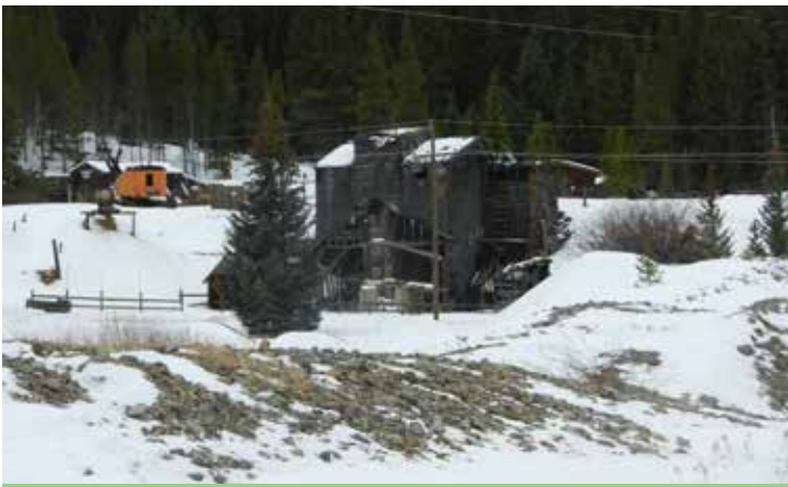
An abandoned gold mine near Breckenridge, Colorado is a visible reminder of an industry that helped develop much of the mountain area of Colorado west of Denver. The stones in the foreground are debris, or "tailings," from the mine.