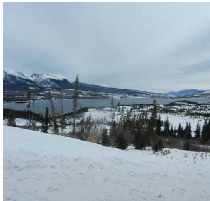
Dillon Reservoir near Frisco, Colorado is a key component in Denver Water's extensive infrastructure.