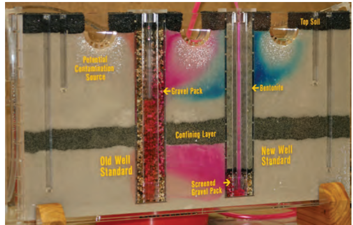
A pumping well constructed using the new state well design standards can become contaminated by pulling in surface contamination through old wells.

Many public drinking water wells in Nebraska draw water from deep, confined aquifers. The first step in well construction is to drill a borehole into the aquifer. After drilling, a casing is placed in the center of the borehole. The casing is a pipe that supports the hole from collapsing and provides a conduit for water to be drawn out of the aquifer. The casing is positioned in the borehole to maintain a uniform space between the outside of the casing wall and the sides of the borehole. This space is known as the annular space or annulus. The top of the well is capped with a watertight, secure cover. Water in the saturated zone of the aquifer must have a way to enter the well casing. This is achieved with a well screen. The screen is located in the water-bearing zone of an aquifer. It has apertures (slots or louvers) in the casing that allow water to pass through. The area around the well screen is packed with clean sand or gravel that stabilizes the aquifer