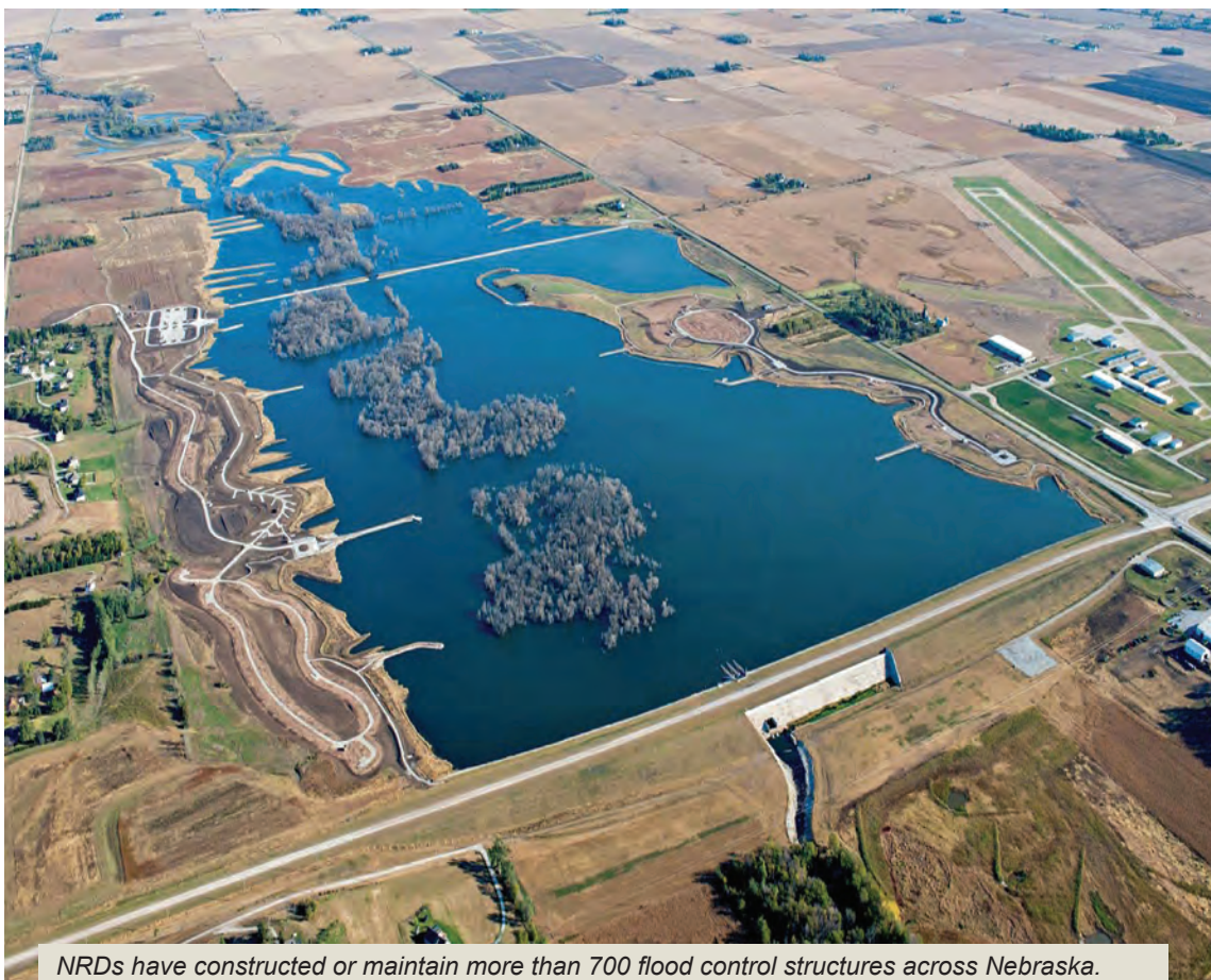
NRDs have constructed or maintain more than 700 flood control structures across Nebraska. Utilizing flood plain management measures, they design and build dams, levees, dikes, drainage ditches and other structures to protect lives and property from flood waters. Shown here is Lake Wanahoo, that opened last year. The 1,777-acre recreation area features picnic shelters, a four-mile walking and biking trail, camping sites and fishing that provide much needed flood control for the area.

By utilizing comprehensive flood plain management techniques, the NRDs design and build dams, levees, dikes,