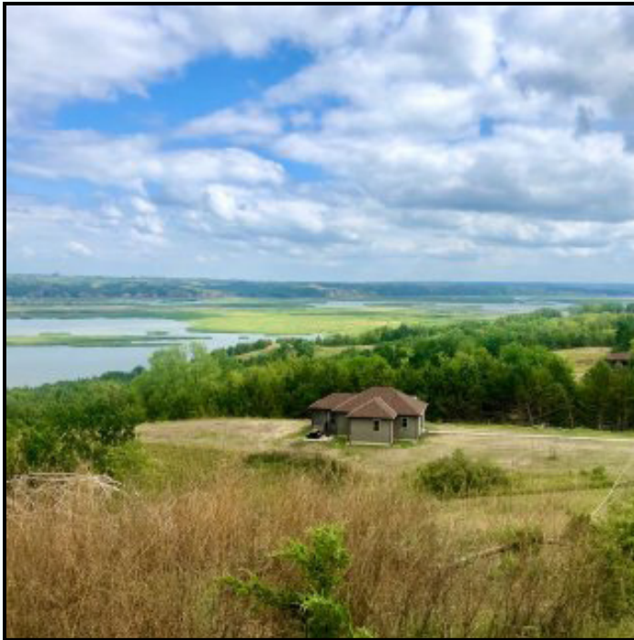
Niobrara State Park