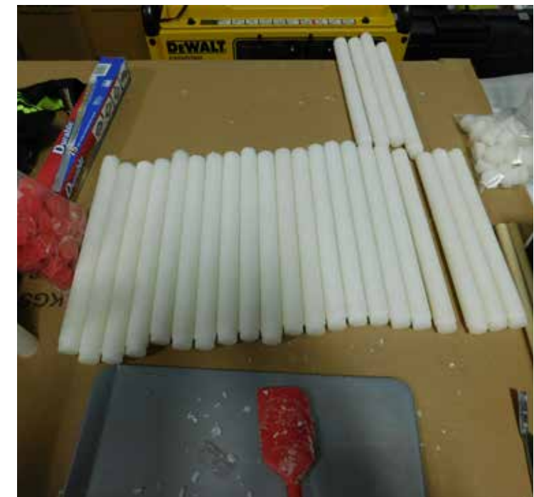
Oxidant candles manufactured by AirLift Environmental in Lincoln.