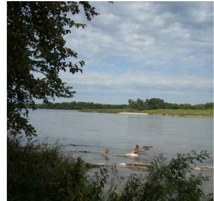
The Platte River in central Nebraska.

"Their scope and emphasis has evolved and broadened since then to encompass many other water, natural resources and environmental-related topics impacting Nebraska," Ress said.