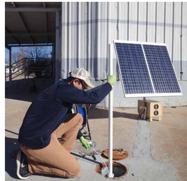
Easy installation of oxidant candles by AirLift Environmental.