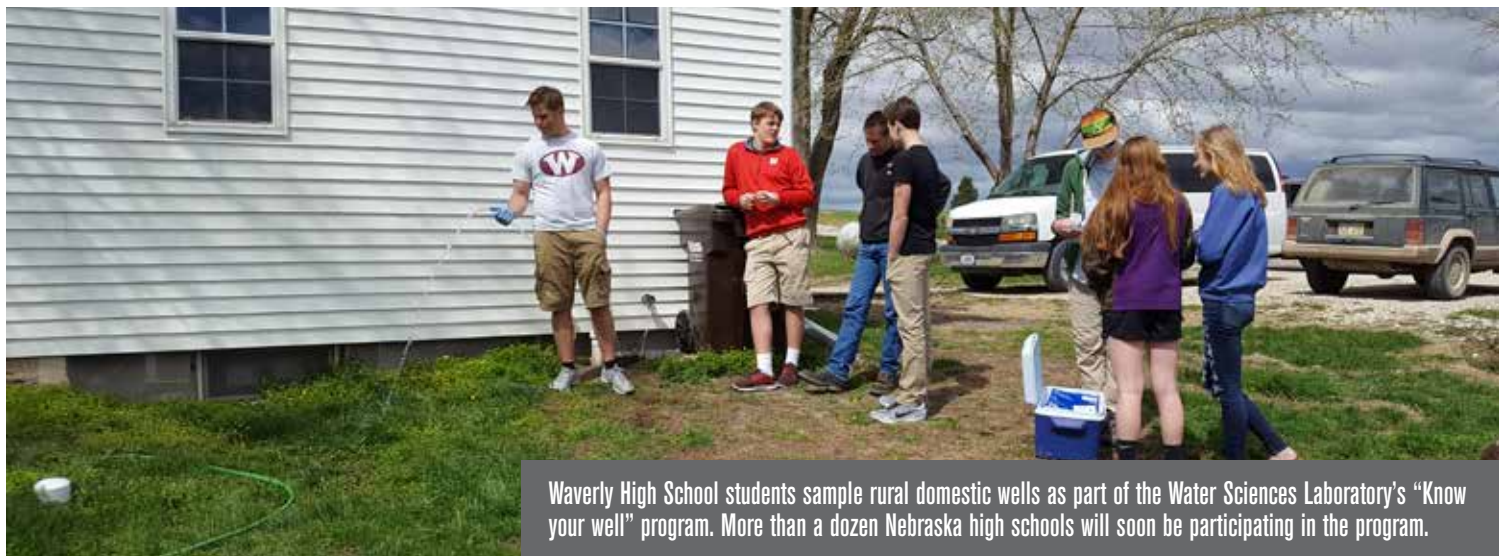
Waverly High School students sample rural domestic wells as part of the Water Sciences Laboratory's "Know your well" program. More than a dozen Nebraska high schools will soon be participating in the program.