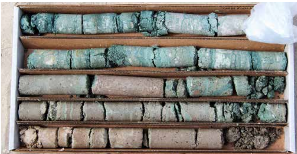
This 10-foot section of core is a part of a nearly 500-foot-deep core, drilled by the Conservation and Survey as part of a CSD mapping program in eastern Cherry County during 2015-2016.