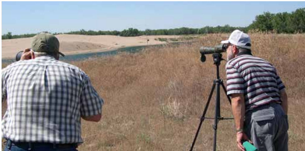
Looking for nesting and endangered species on the Platte River near Lexington.